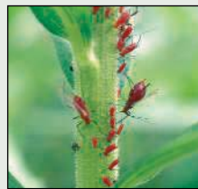
Aphids on goldenrod (bottom) and a predatory ladybug (top).

winged and nonwinged offspring as carbon dioxide and ozone concentrations increase, and that these responses interact with responses to beetle predators and hymenopteran parasitoids. Under higher carbon dioxide, the aphids produce more winged offspring in the presence of predators. Under higher ozone, more such offspring are produced in response to parasitoids. Thus, atmospheric change has the potential to affect an organism's response to higher trophic levels, suggesting that food web dynamics can be altered too. — AMS